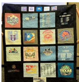
Cathy P. – Flood Recovery Quilts for CASA